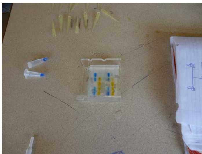
Figure 2 Analysis of Family Tree - Disease Inheritance Experiment Analysis of the results by the students reinforced the basic concepts of genetic inheritance.

We thought it could, but part of what we wanted to achieve was quite different to many of the other outreach programmes that we have been involved with 1 . We were still going to a school with the fancy gadgets and the expertise of career researchers, but our aim was not to excite or educate students about science. Instead, we wanted to inspire and educate the teacher about science and help them develop new skills that they could use in the classroom. We also wanted to clearly link science study to jobs. We wanted to use the fun of practical science to engage the students so we could talk specifically about careers. Could we raise their aspirations beyond the local horizon to see some of the other options open to them?